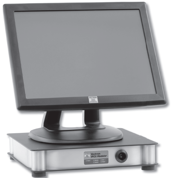
Vectron POS Modular with Monitor Vectron D151T