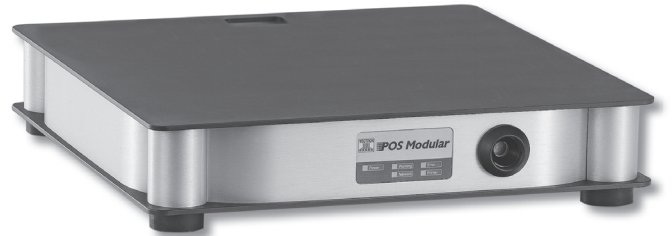
Vectron POS Modular with „Addimat“ lock