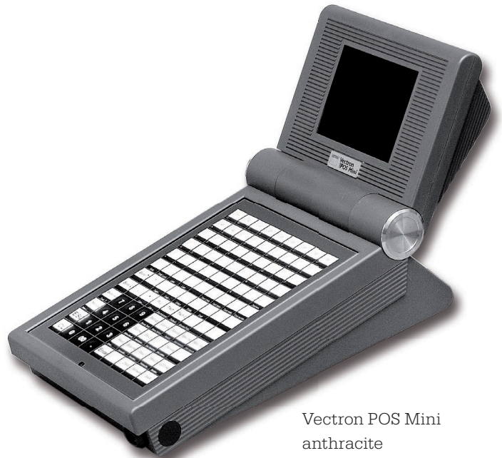
Vectron POS Mini anthracite