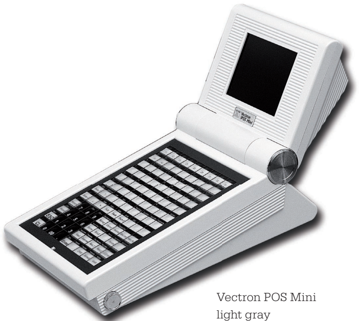
Vectron POS Mini light gray